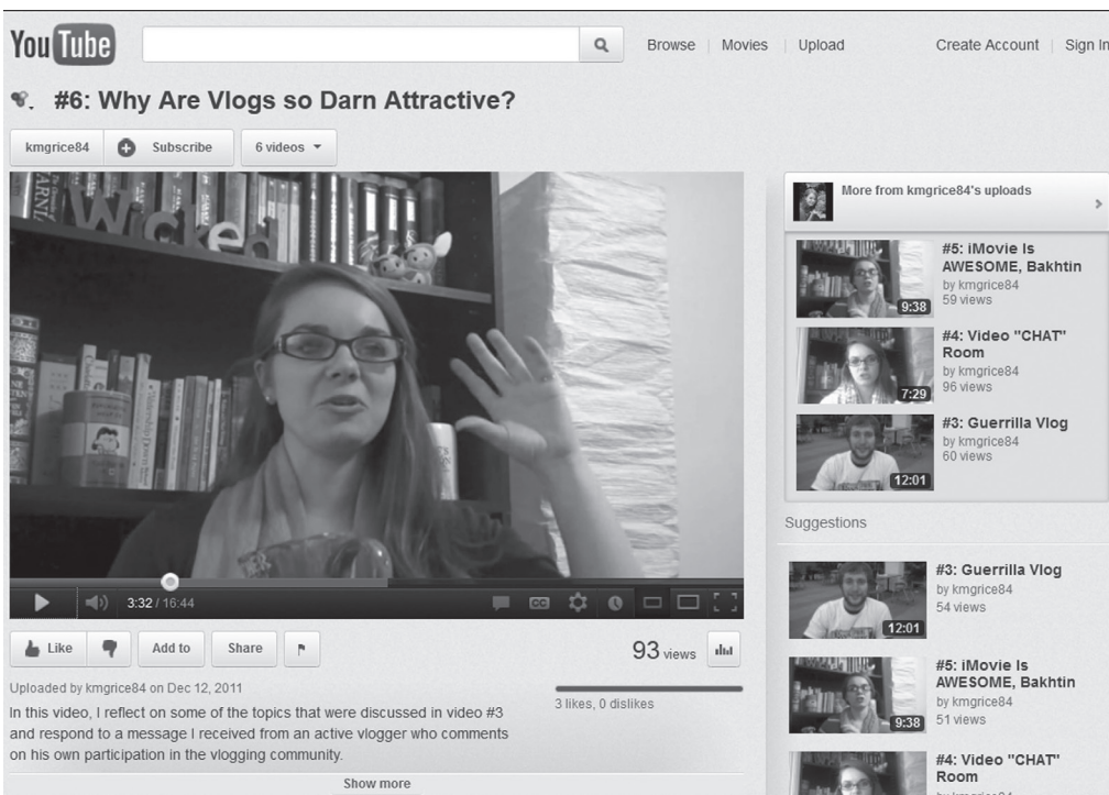
Figure 2: Specific Video Screen

After clicking on the chosen video, you'll be taken to a separate screen that will play the video and provide you with more information (see Figure 2). Above every video will be its specific title. Beneath it, you'll find the date it was posted, the number of times someone has viewed this specific video, and a short blurb explaining it. This lower information box, lovingly nicknamed a "doobly-doo" by vloggers Hank and John Green, is where the author can provide the audience with a summary of the video along with any other important information like sources or links. This information will be originally condensed due to screen space, so in order to see everything the author has written, you'll need to click the "Show more" tab.